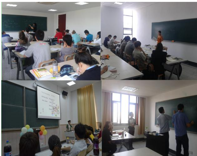
Chinese language class