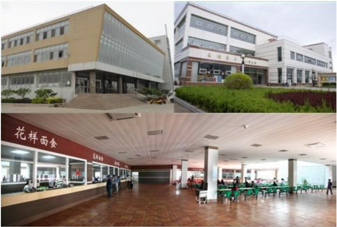
Canteen at campus