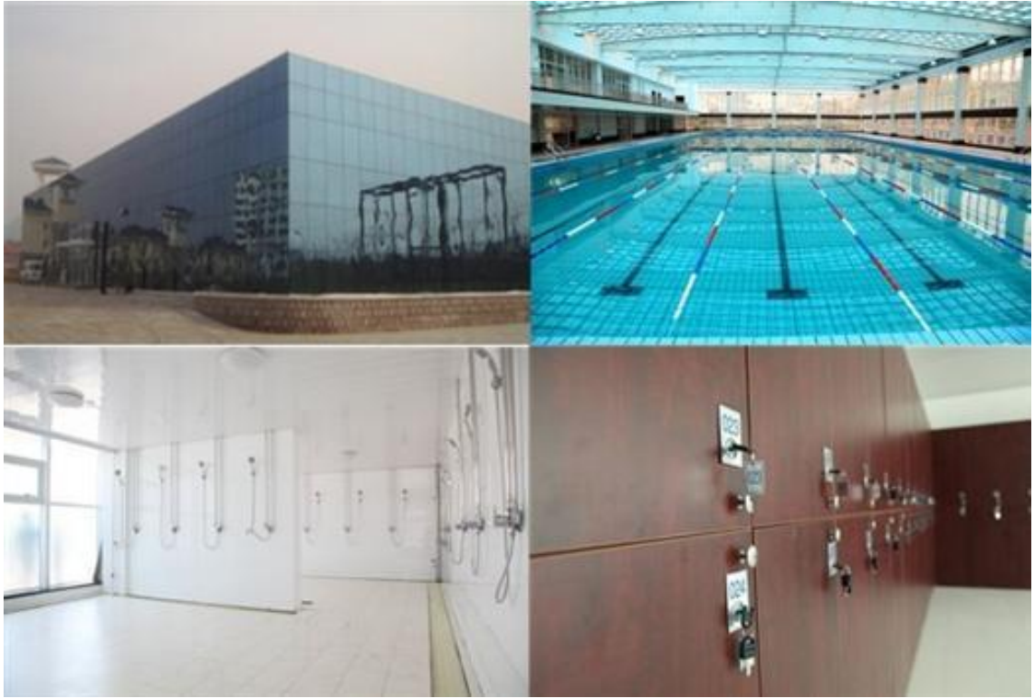
Indoor swimming pool