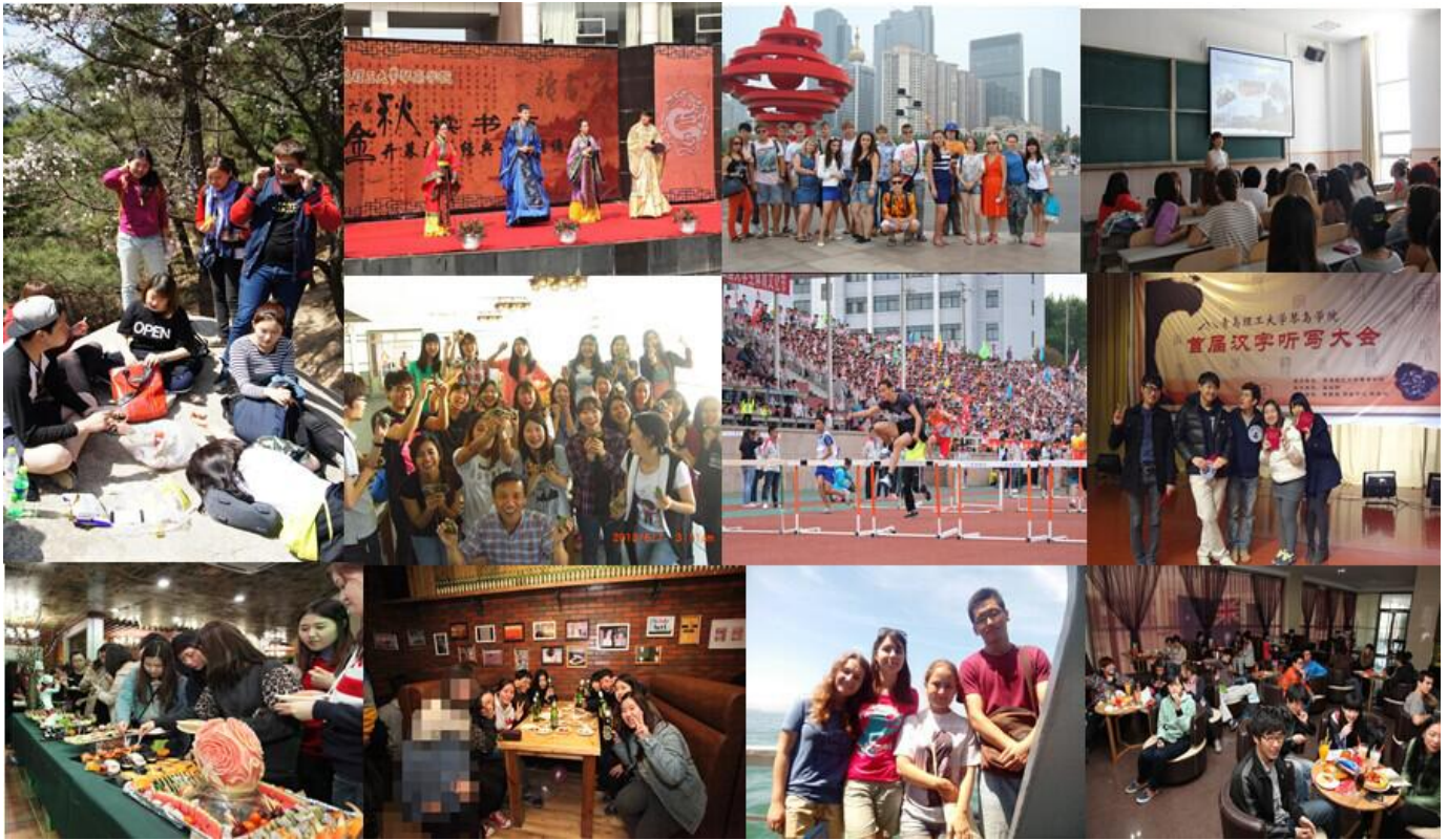
Variety of activities