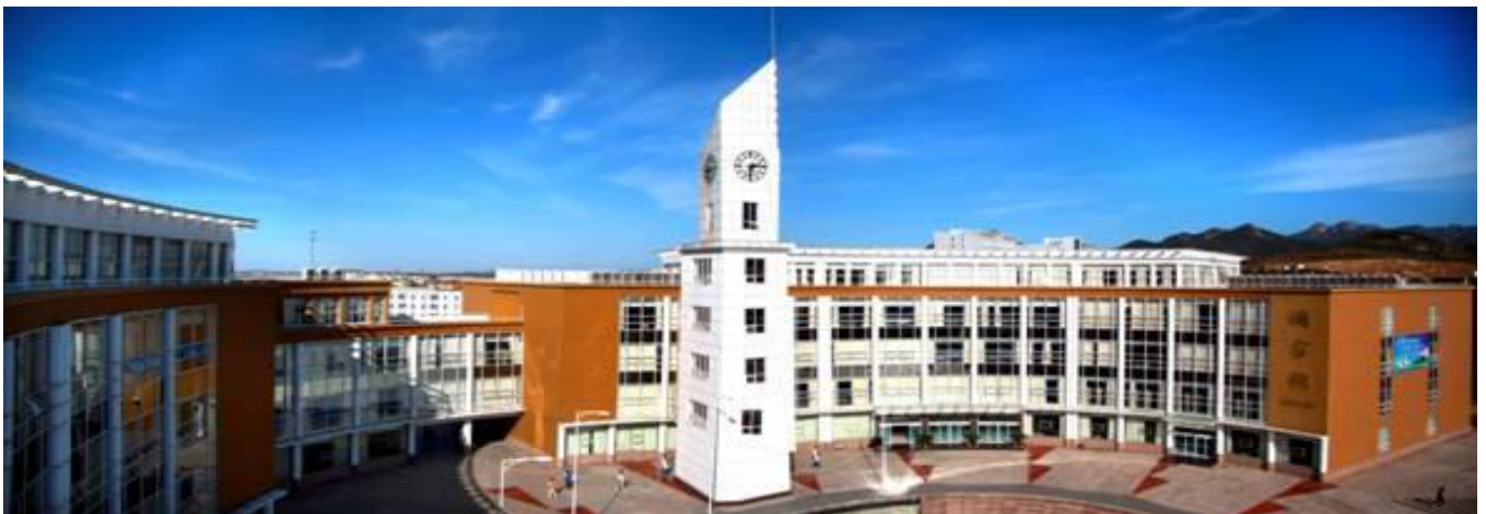
Welcome to Qindao College